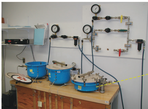
(a) Test assembly

7.6 Prepare the kaolin paste (see Note 4) by mixing 125g of kaolin powder with 150g distilled water and apply it directly onto the saturated plate.